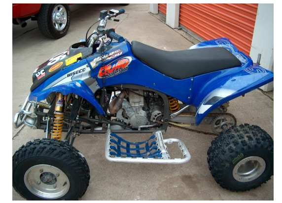
Gas Gas ATV Figure 1