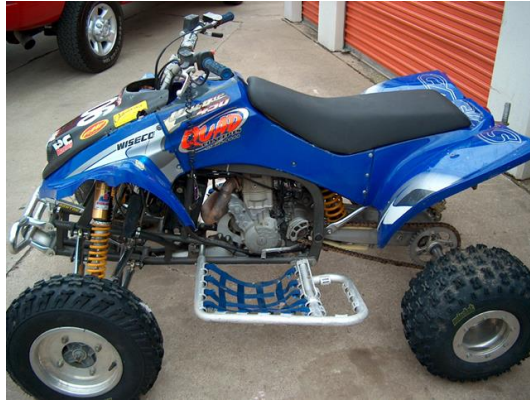
Gas Gas ATV Figure 1